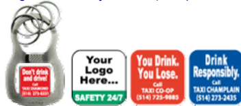
#1955 - Alcohol Breathalyser tester

- Item #1960 - Kits includes LeClasp Safety First Key Holder (#1450) decorated with the organization logo and safety slogan on the FRONT side and displayed on the BACK side with the local taxi fleet phone number (#1252) as well as... snugly tucked into the packaging a Single-Use Breathalyzer Tester (#1955).